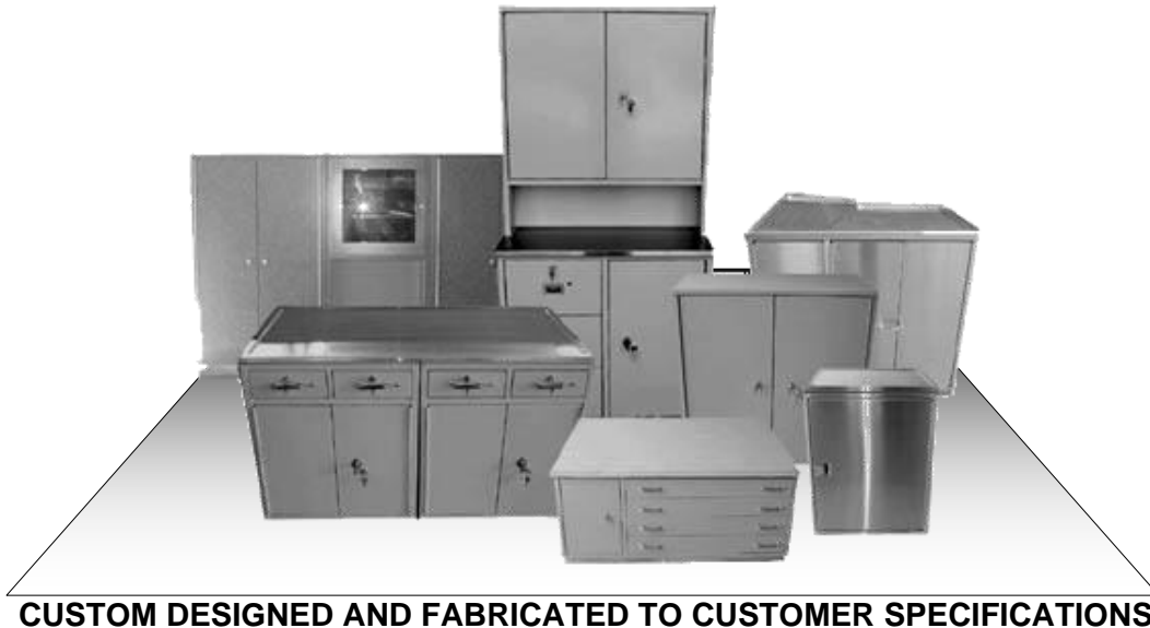
CUSTOM DESIGNED AND FABRICATED TO CUSTOMER SPECIFICATIONS