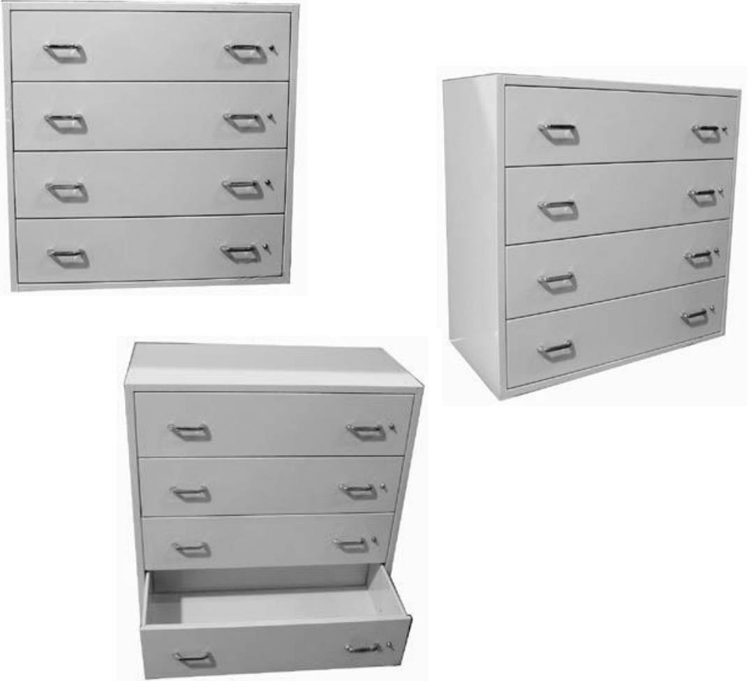
4 DRAW DRESSER